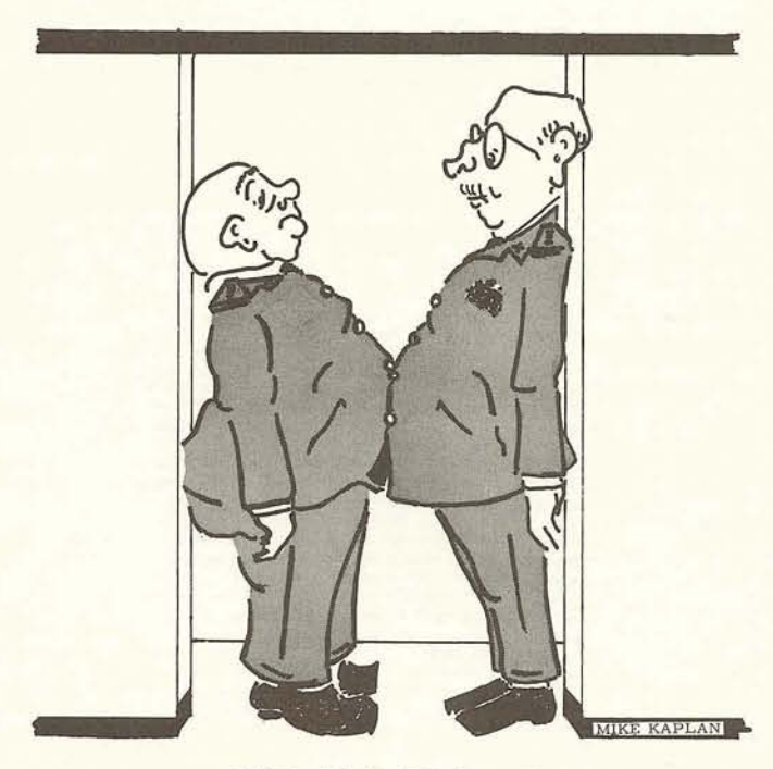
THE BATTLE OF THE BULGE(S?)